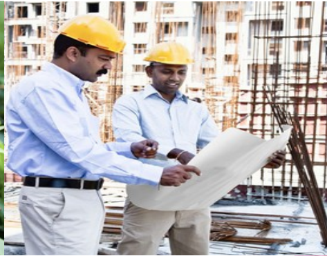
Public Private Development Partnerships