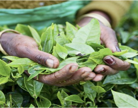
Drivers of Change